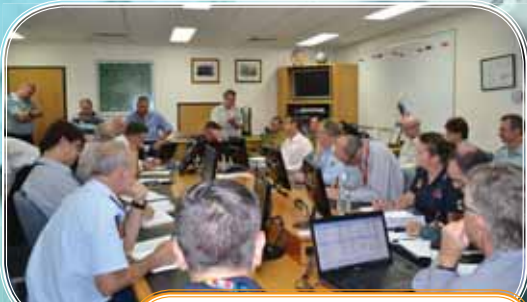
Local Disaster Management Group Meeting