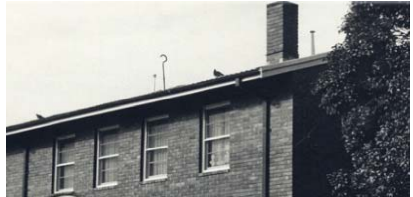
Archive picture of Salvation Army Boys' Home, Bexley, NSW.

They had strict schedules for getting up, eating, praying, washing and lights-out.