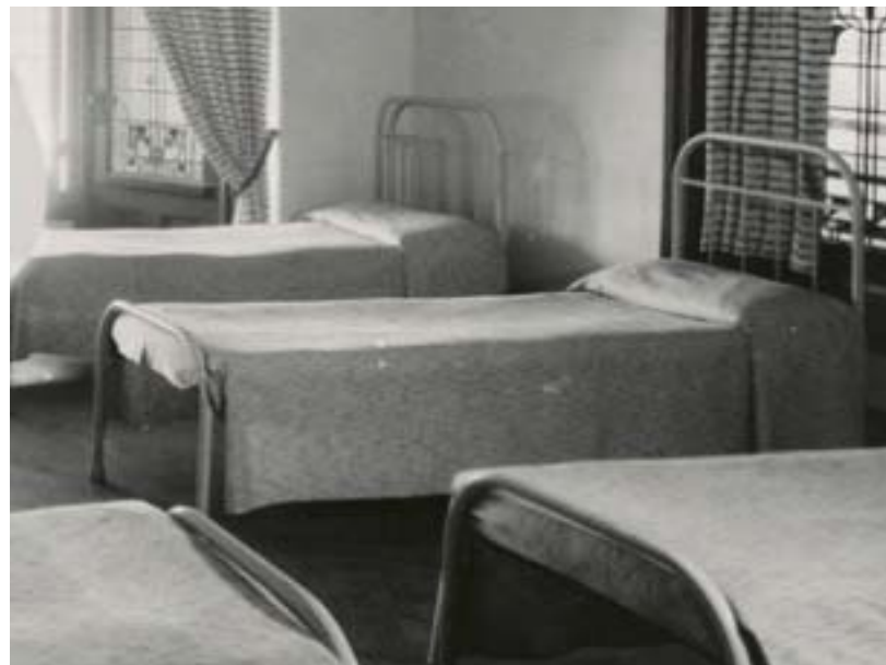
Archive picture of Salvation Army Boys' Home, Bexley, NSW.

Many may find it difficult to imagine things which, in an aged care setting, others may take for granted – such as sending their clothes to the laundry along with everyone else's.