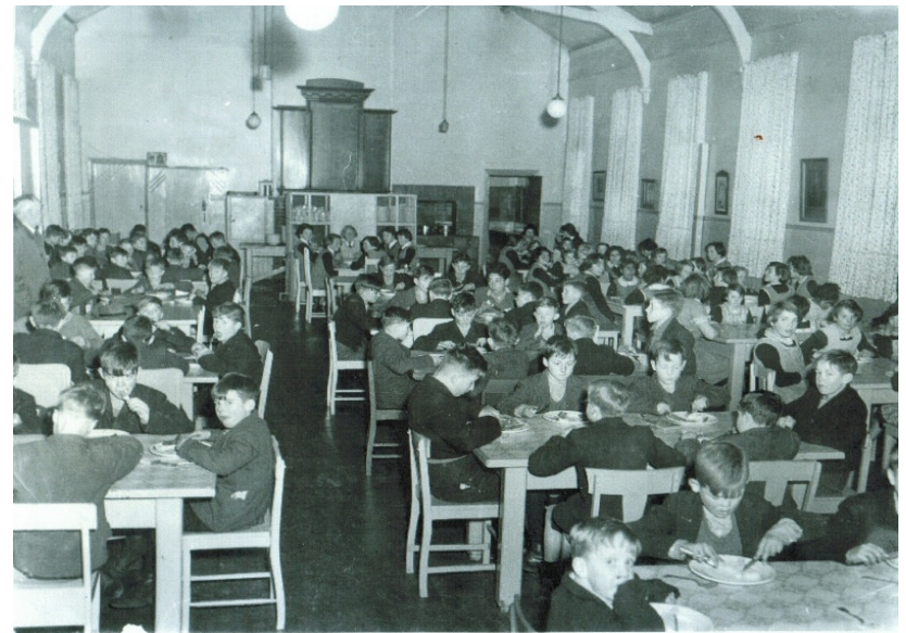
Archive picture of Ballarat Orphanage, Victoria.

They came from all parts of Australia and all levels of Australian society.