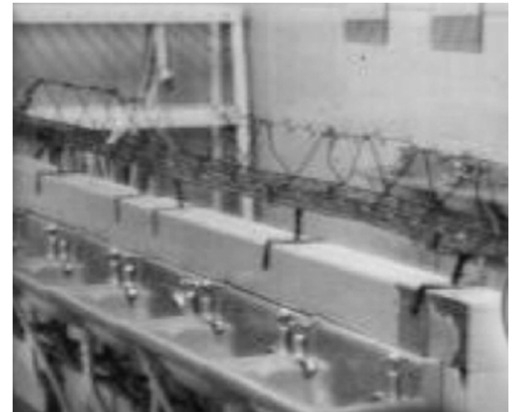
Archive picture of Salvation Army Boys' Home, Bexley, NSW.

Many people experienced physical or sexual abuse. This is particularly important to consider when providing daily care services, such as dressing, undressing or bathing.